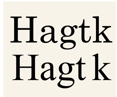
CENTURY IS MORE INDUSTRIAL STRENGTH