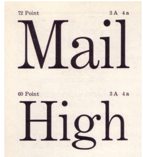
CENTURY EXPANDED, A NARROW TYPEFACE WITH A WIDE NAME

Century Schoolbook's initial appearance was in a 1920 supplement to ATF's large type catalog published several years earlier. This was followed by a much more elaborate showing in the company's typographically famous 1923 typeface catalog.