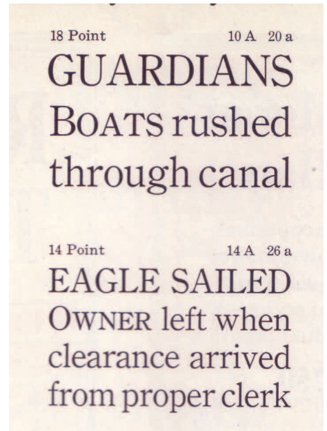
A CENTURY BASED ON OLDSTYLE LETTERFORMS

International Typeface Corporation also issued an adaptation of the Century design style. The ITC Century® design is a melding of the basic proportions and characteristics of the original Century with Century Expanded and Century Schoolbook. Tony Stan, the designer of ITC Century, based his work primarily on Century Expanded. However, he incorporated the stronger character stroke, smooth weight transfer, serifs and bracketing of Century Schoolbook and thus made the design less delicate and more useable.